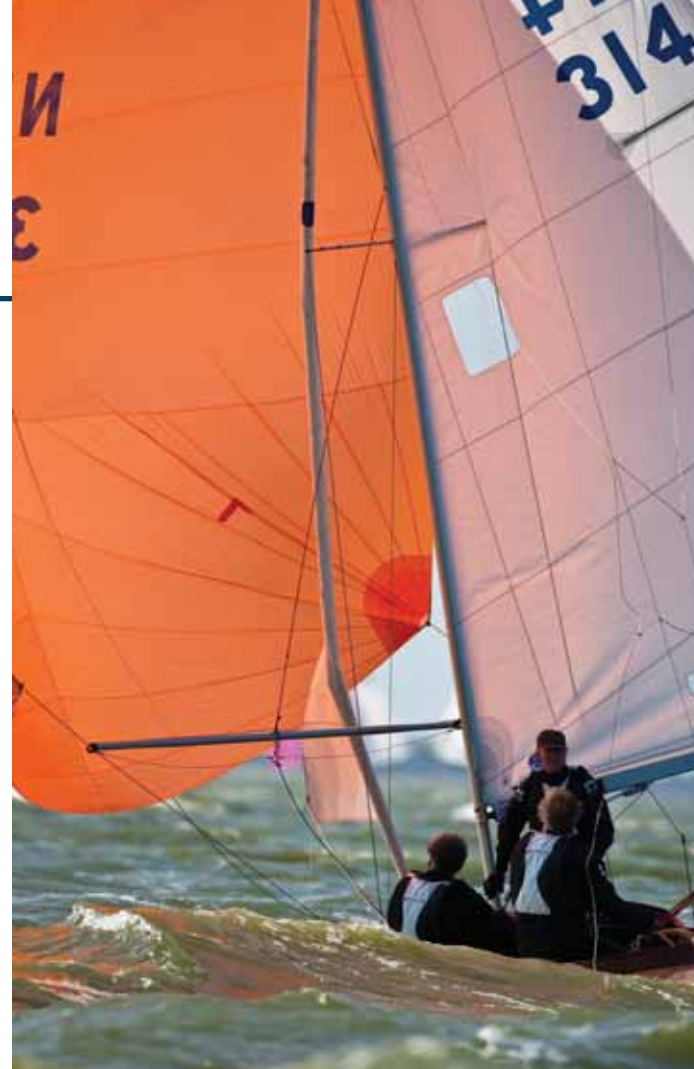
Front Cover Photo & Right: Gaastra Dragon World Championship 2009.