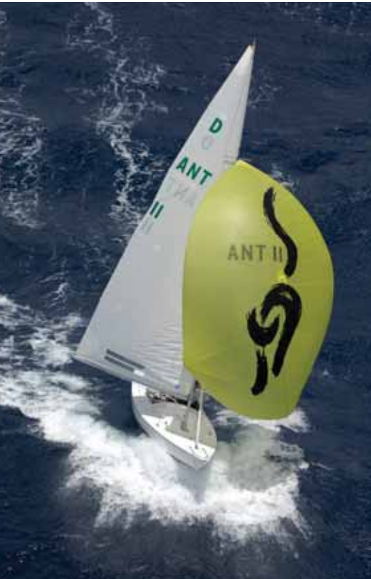
Antigua – Blasting downwind.

The Antigua Dragon season starts in December and ends after Antigua Sailing Week in early May. During the 2008/09 winter, many